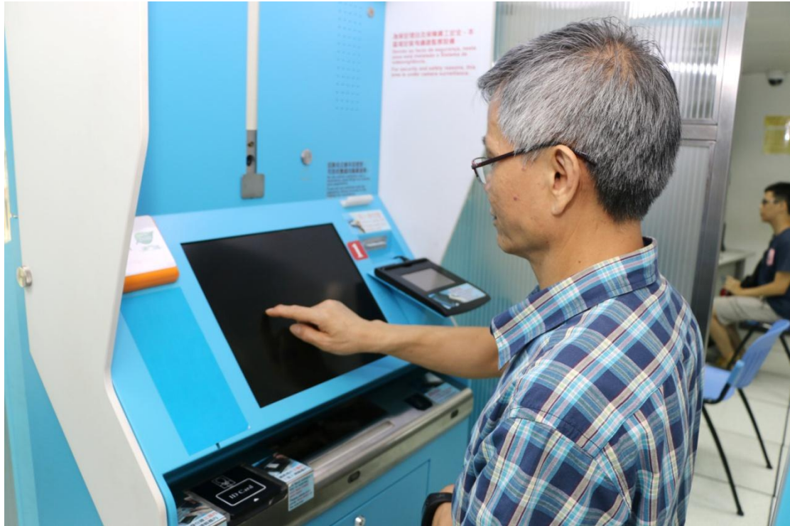
Elderly persons can use self-service kiosks to lodge the application for replacing their identity card