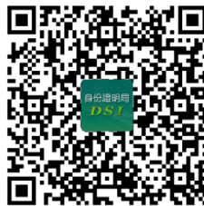
QR Code for obtaining “tag number of the day” or making appointment

For details about the application formalities of the Macao SAR Resident Identity Card, self-service kiosk for renewal of permanent resident identity card and self-service kiosk for making appointment and ticketing, please visit DSI's website ( www.dsi.gov.mo ).